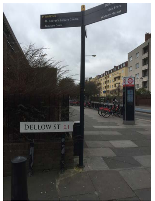
Direction to Wapping