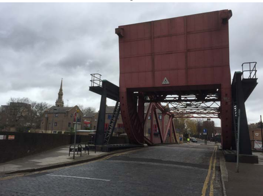
One of the many drawbridges over the waters, leading to wharfs

An historical and economical information: