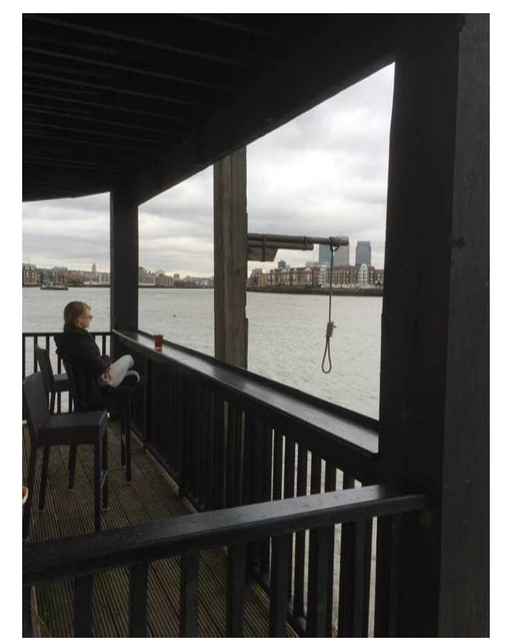
A reconstruction of an execution dock, for piracy. (Last execution Dec. 1830)