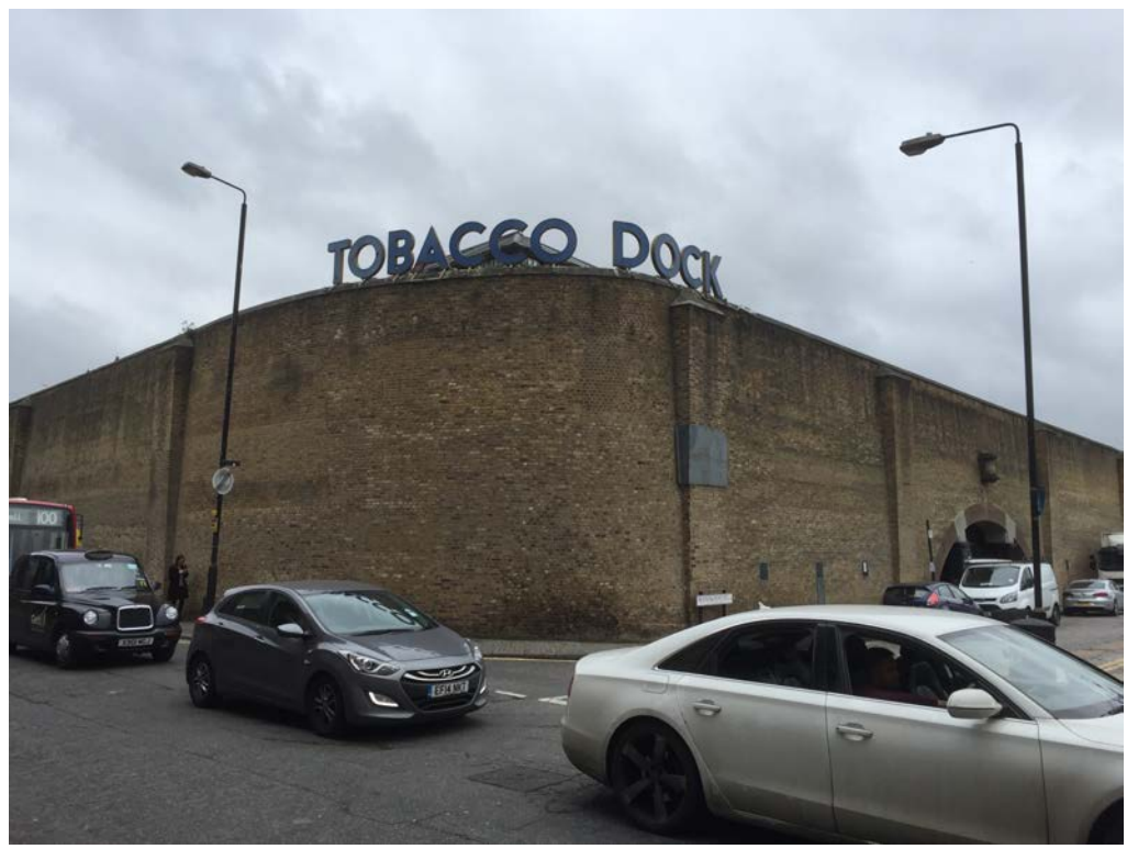
One of the many dismissed docks of the harbor of London

Very, very charming places, where you will feel the power of the great history of harbor of London.