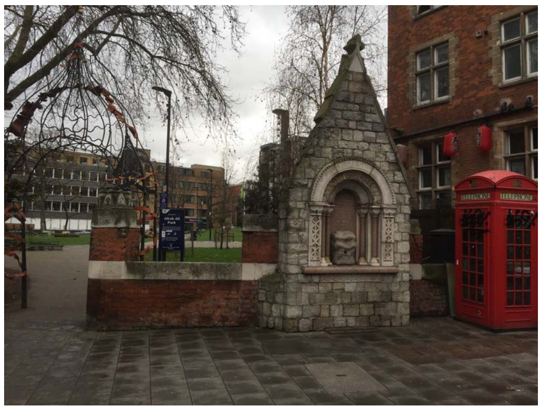
Entrance of the disappeared, old church of St Mary Matfelon

You can have the feeling of it, from the remains of its charming entrance.