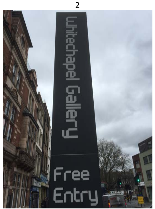
Whitechapel Art Gallery

On the opposite site, there is a green space, a park now, but upon the time here lied a great church, St Mary Matfelon.