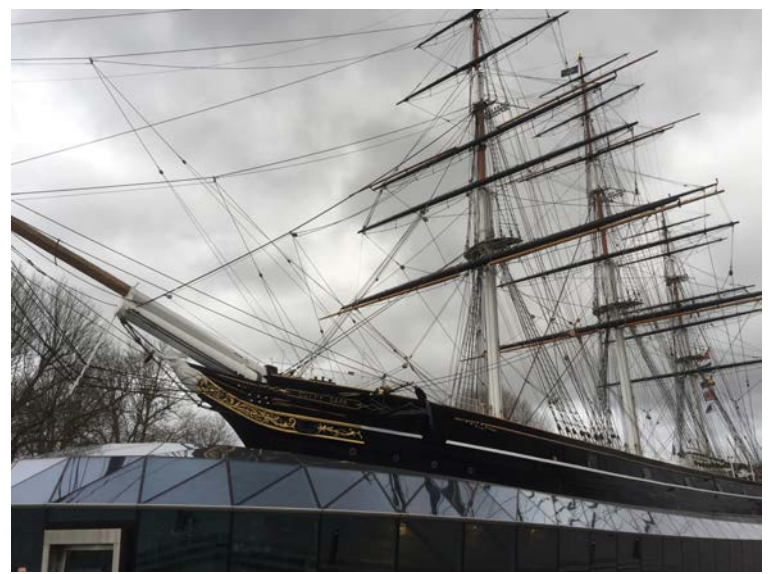
The rebuilt Catty Sack

After the tunnel, you arrive in Greenwich, just in front of Catty Sack. Catty Sack burned totally for few years ago, but was rebuilt.