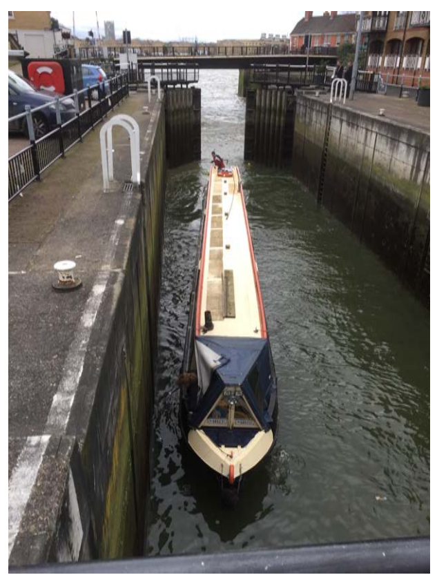
Water leading to wharfs and canals from the Thames, near Wapping