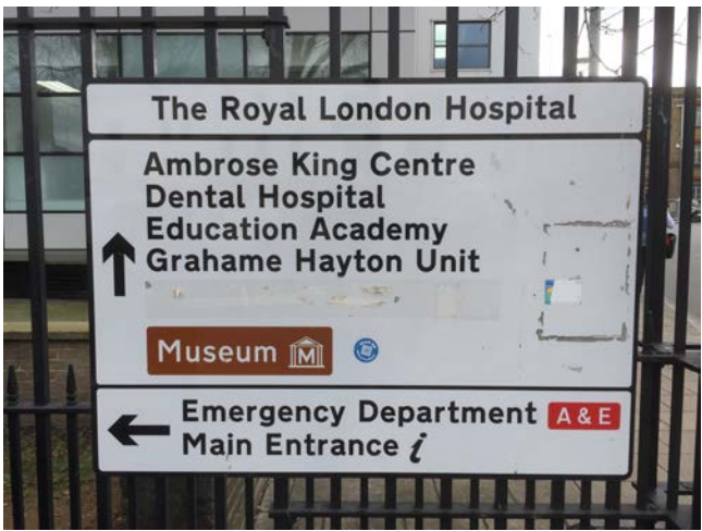
Entrance from Whitechapel Road

Continue toward east until you arrive to Royal London Hospital. Find its museum. A visit is worthy. You will learn how difficult live was for Londoners for only 100-200 years ago.