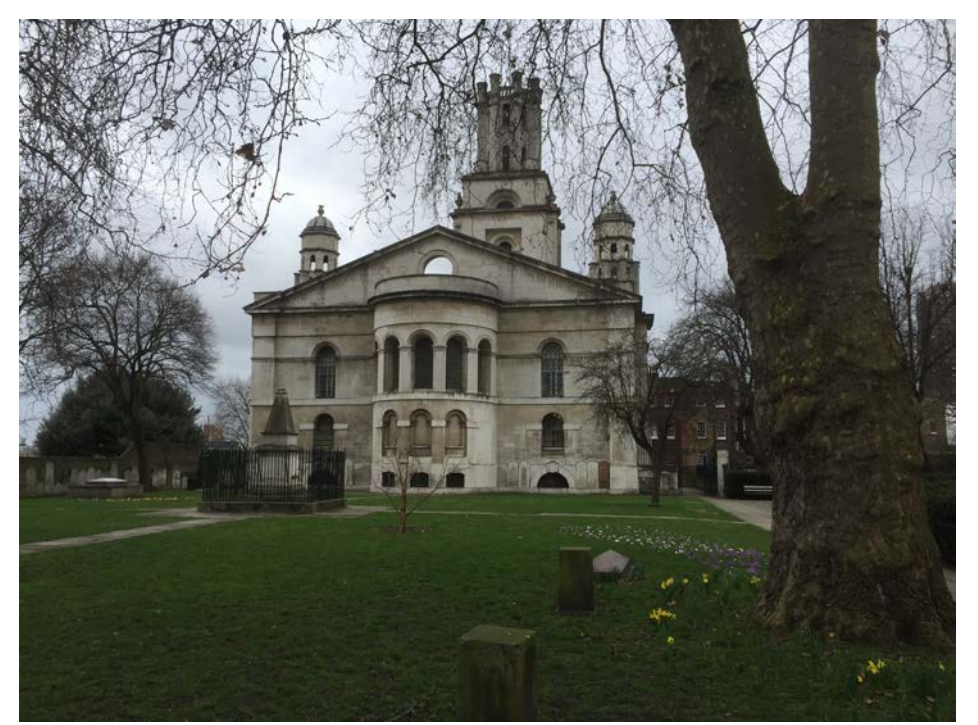
The remains of Saint George Church, German bombs in 1940 destroyed the interior.