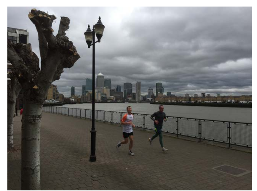
Promising bankers during a break from their offices in Canary

During the last decade, the dismissed stores have been refurbished to expensive apartments, which are residential areas for the bankers of Canary Wharf, in the nearby. You will find bankers everywhere here, because they use the river path for jogging. Very sporting people!