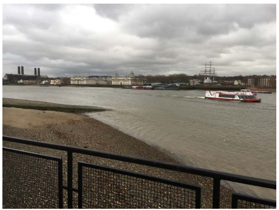
Here in 1750 stood 12 windmills, a wall of windmills. Greenwich is on the other site of the Thames.