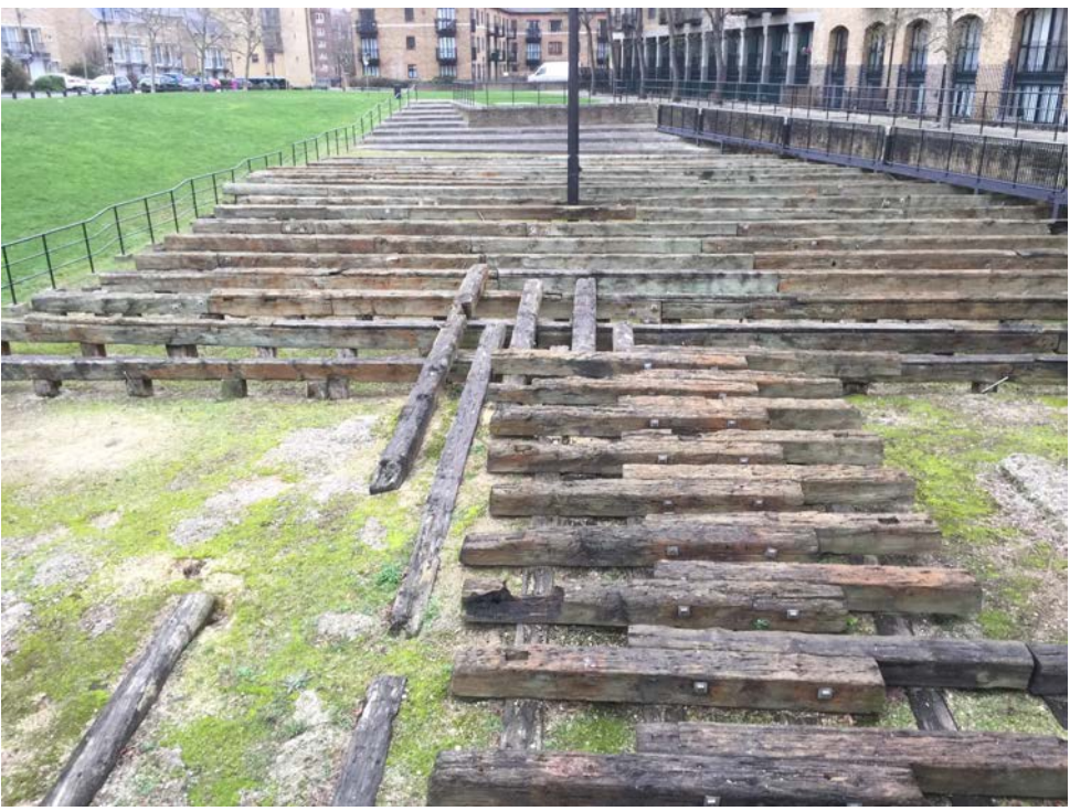
The remains of an old wharf

Wapping is on the east of London, it was here in Wapping that the Thames starts deepen. This facilitated the sailing of bigger commercial ships/barges/etc. It is here around Wapping where the harbor of London lied.