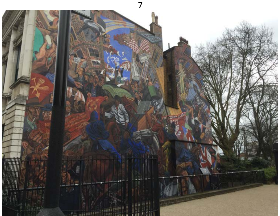
The mural painting of the Battle of Cable Street (The best way to find it is from the garden of St George Church)